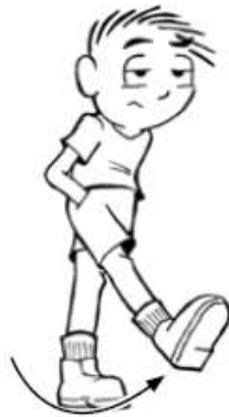
Small arrow = smaller force

You use forces around your house and in your everyday life. You can represent a force in a picture with an arrow. The bigger the arrow, the larger the force.