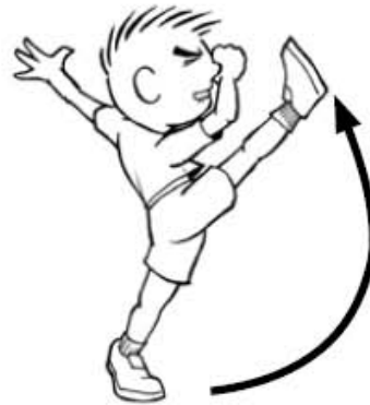
Bigger arrow = bigger force